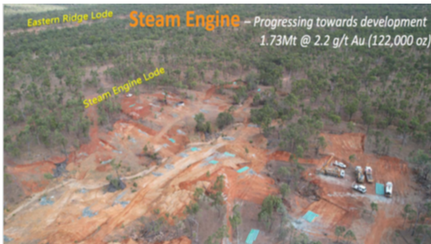
Superior Resources' Steam Engine.